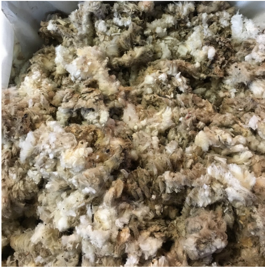
A well-prepared line of board and table locks.