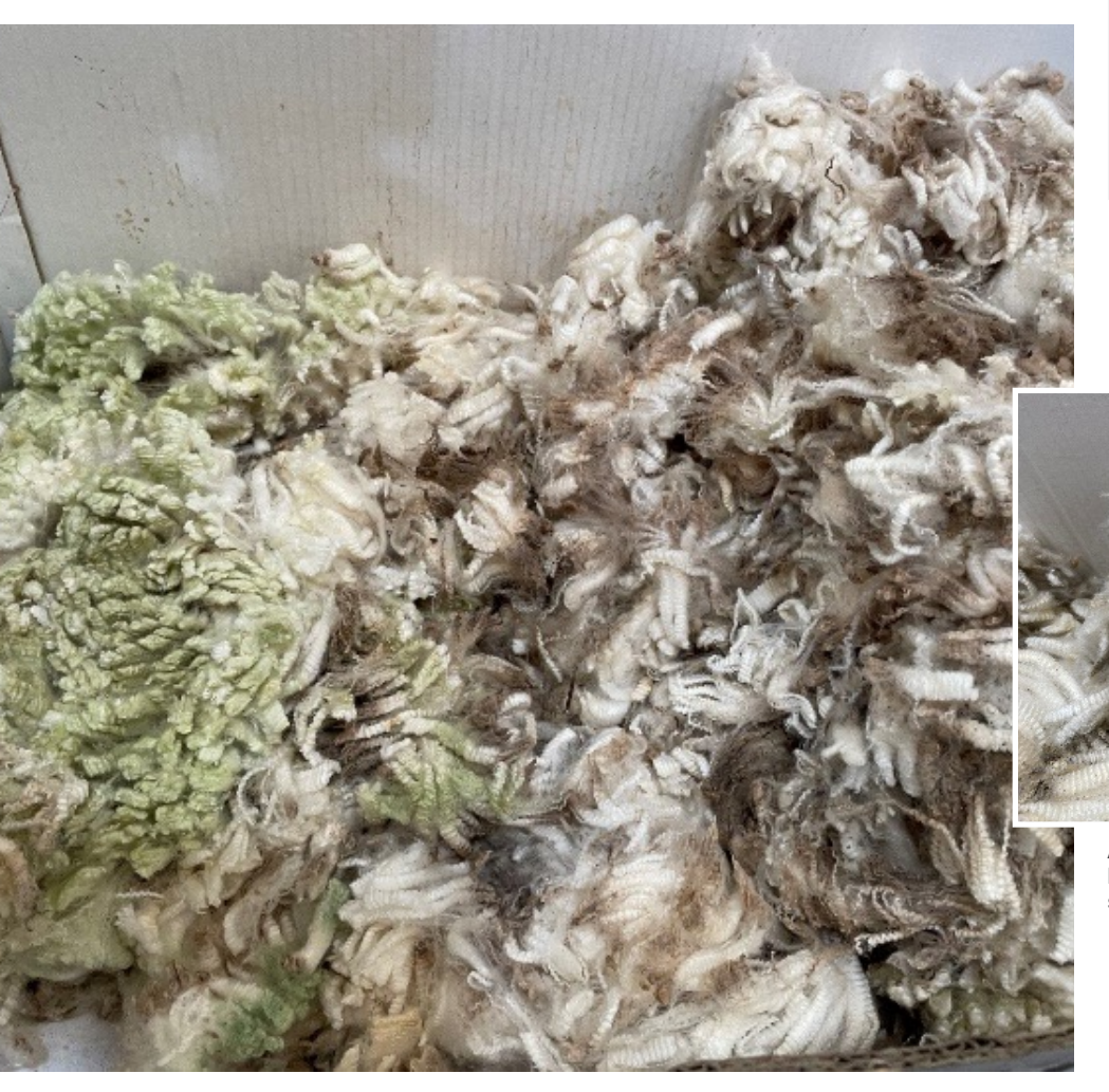
A High incidence of water colour has been observed by AWEX show floor Auditors from all regions.

*Do not remove full length skirtings from the back legs on the board*.