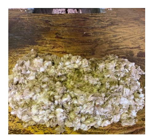
Board locks consisting of regrown crutch wool