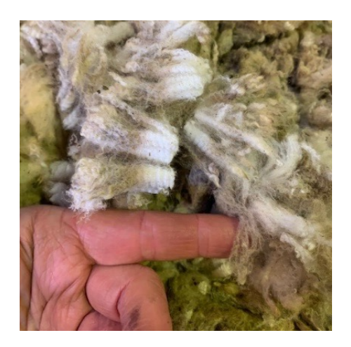
Locks from the breech of a crutched ewe.