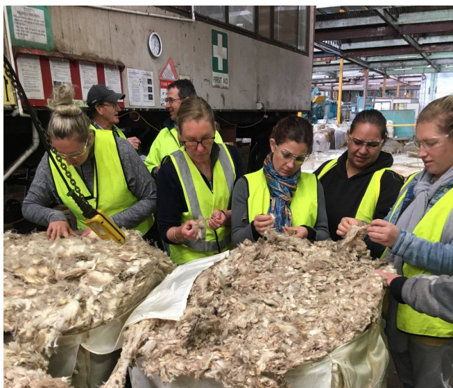
Master Classer (2019) course participants inspecting farm bales prior to scouring.

The Master Classer course for 2020 has been postponed until further notice due to COVID-19 travel restrictions and social distancing rules. Thank you to the Classers that have expressed interest in attending. Your nominations will be considered when the course is rescheduled. If you know a classer who you think would be interested in increasing their knowledge of the wool pipeline, please contact Fiona Raleigh: e.fraleigh@awex.com.au