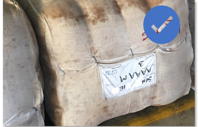
Flat label with large easy to read details.