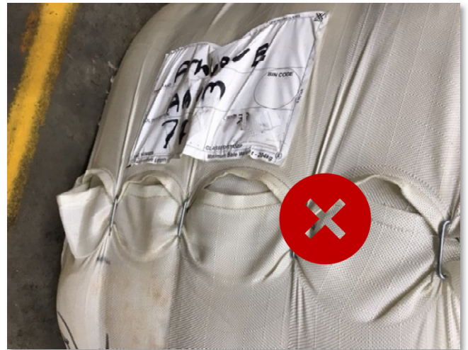
Bale details difficult to read due to excessive wrinkling from too much tension applied when closing bale.