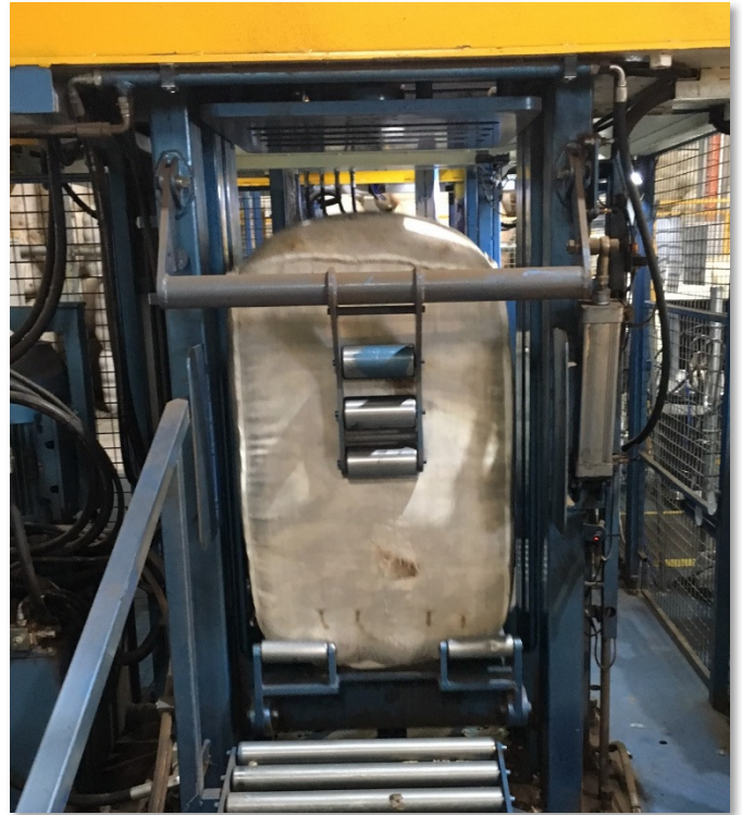
Bale in Core chamber

The bale head must not be domed or lop-sided. Bales are inverted during core sampling. Lop-sided or domed bales tip and jam, needing to be manually removed from the core chamber.