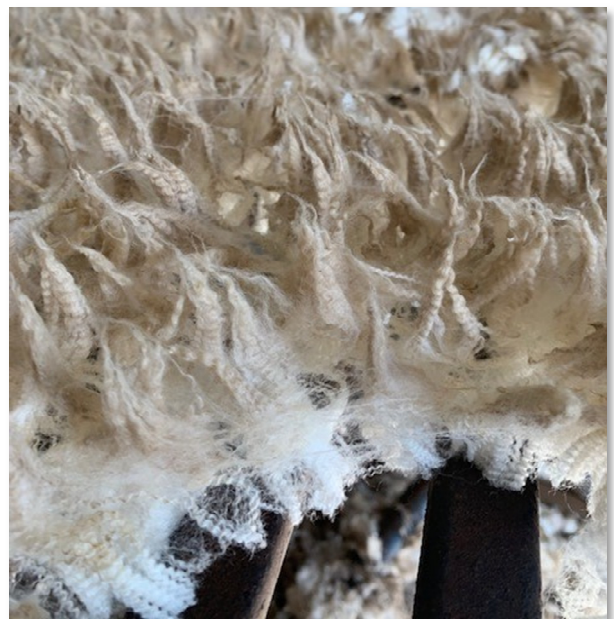
Weaners Tip - first shearing (over 50mm), Age Code 1.

When using WoolClip select 1st Shearing when adding a mob as Age Code 1.