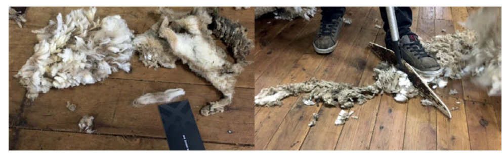
Shank wool removed with paddle, combing length wool attached. This wool was placed in a stain line. It is a non -conforming lot due to mixed length and wool category.

When sweeping to remove shanks and short crutch wool, separate the heavy cotted shanks and place in an M SHK line leaving the short crutch wool to be placed in a locks line.