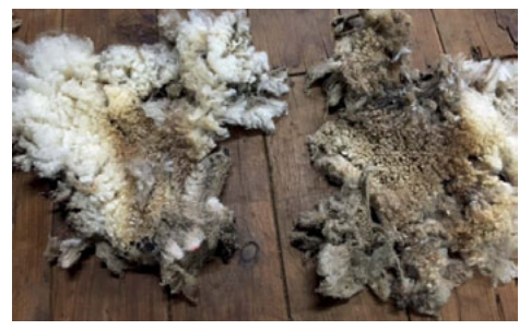
COL M BLS

A line of briskets with no urine stain should be described as COL (breed) BLS.