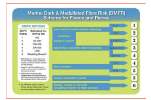
Ref. CoP section 9, Dark and Medullated Fibre

The NWD will be used to calculate the DMFR (dark and medullated fibre risk) rating for each mob. Note: DMFR applies to Merino fleece and piece lines only.